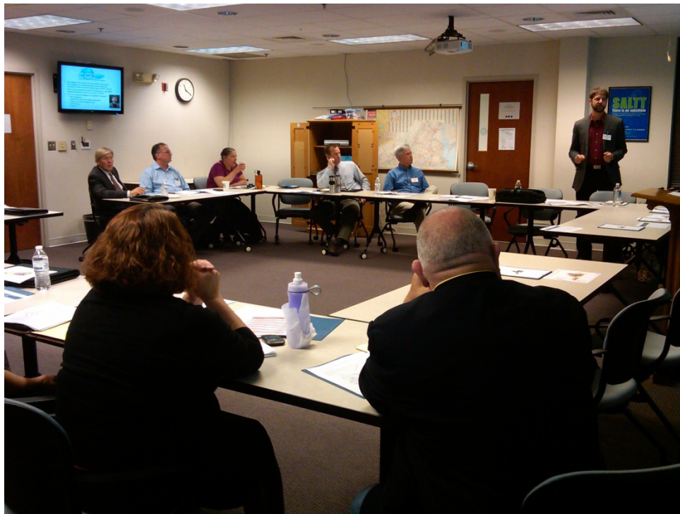
VHM MAC Meeting, May 10, 2012