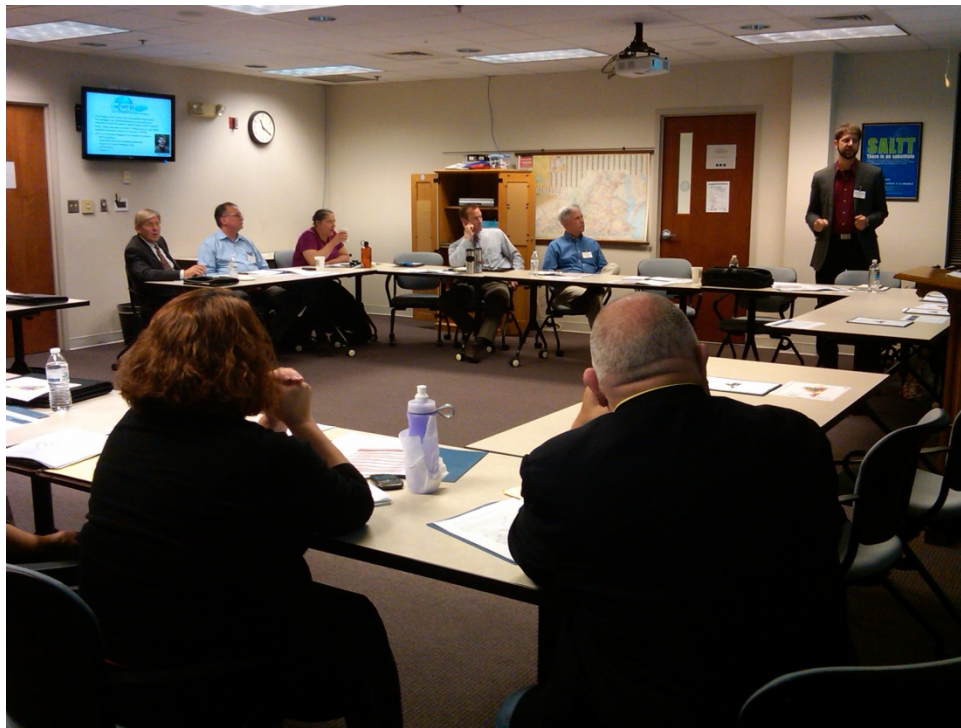
VHM MAC Meeting, May 10, 2012